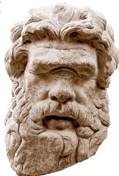
▲ This is a marble sculpture of Polyphemus, a cyclops, or one-eyed monster, who appears in another of Homer's epics, the Odyssey .