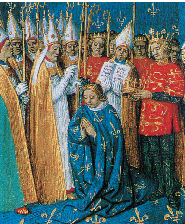
▲ The coronation of Philip II in Reims Cathedral