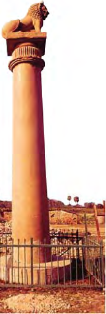
▲ This pillar, on which Asoka's edicts are written, is located at Vaishali.

Edicts are official, public announcements of policy.