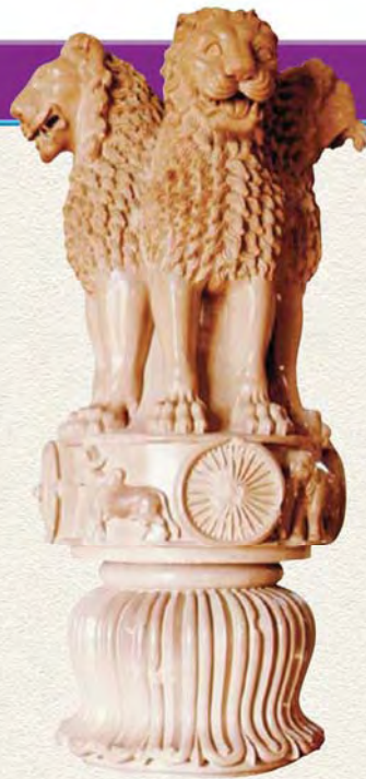
▲ This grouping of Asoka's lions is used as a symbol of India.

RESEARCH LINKS For more on Chandragupta Maurya and Asoka, go to classzone.com