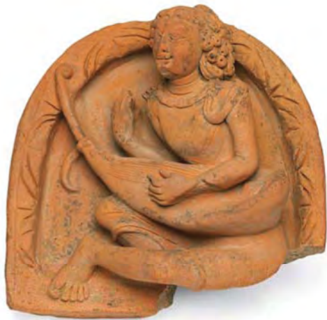
▲ This terra-cotta tile, showing a musician playing a stringed instrument, is from a Hindu temple of the Gupta period.

Daily Life in India The Gupta era is the first period for which historians have much information about daily life in India. Most Indians lived in small villages. The majority were farmers, who walked daily from their homes to outlying fields. Craftspeople and merchants clustered in specific districts in the towns. They had shops on the street level and lived in the rooms above.