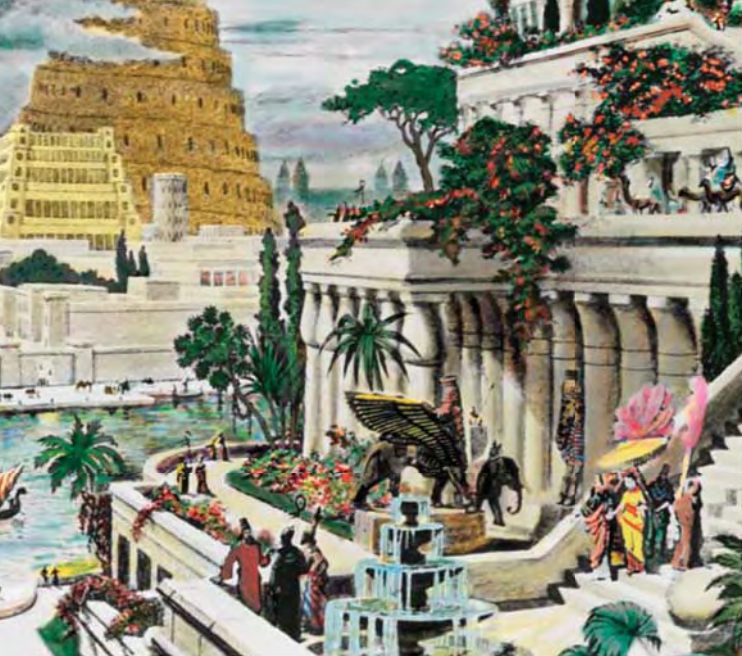
▲ This is an artist's rendering of the legendary hanging gardens of Babylon. Slaves watered the plants by using hidden pumps that drew water from the Euphrates River.

of a new empire, more than 1,000 years after Hammurabi had ruled there. A Chaldean king named Nebuchadnezzar (NEHB•uh•kuhd•NEHZ•uhr) restored the city. Perhaps the most impressive part of the restoration was the famous hanging gardens. Greek scholars later listed them as one of the seven wonders of the ancient world. According to legend, one of Nebuchadnezzar's wives missed the flowering shrubs of her mountain homeland. To please her, he had fragrant trees and shrubs planted on terraces that rose 75 feet above Babylon's flat, dry plain.