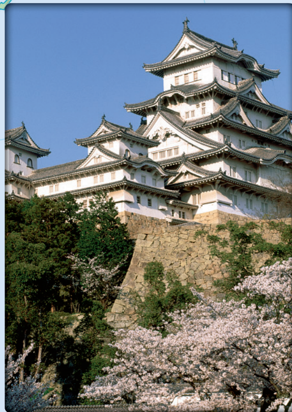
▲ Himeji Castle, completed in the 17th century, is near Kyoto.