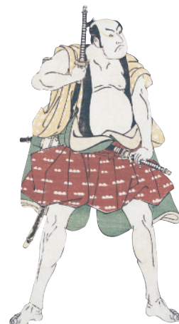
A samurai warrior ▼

Following his own motto “Rule the empire by force,” Nobunaga sought to eliminate his remaining enemies. These included rival daimyo as well as wealthy Buddhist monasteries aligned with them. In 1575, Nobunaga’s 3,000 soldiers armed with muskets crushed an enemy force of samurai cavalry. This was the first time firearms had been used effectively in battle in Japan. However,