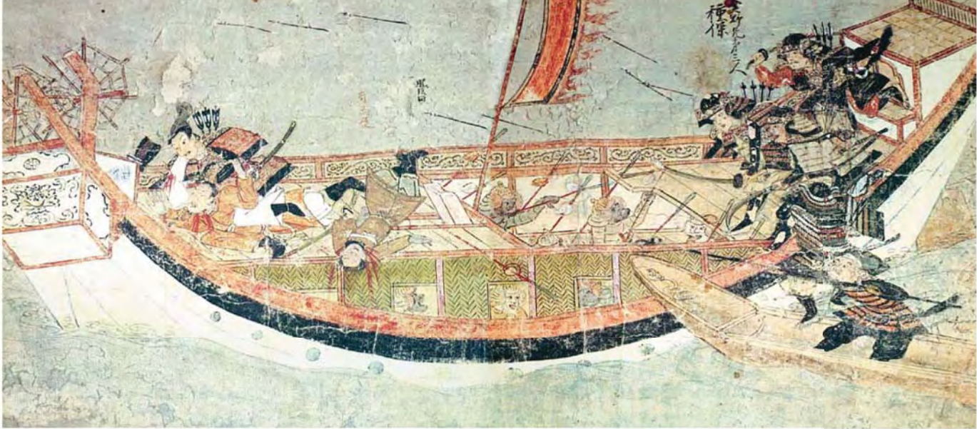
▲ This detail from a 13th-century Japanese scroll depicts Japanese warriors fighting off a Mongol warship.

against Japan. The Mongols forced Koreans to build, sail, and provide provisions for the boats, a costly task that almost ruined Korea. Both times the Japanese turned back the Mongol fleets.