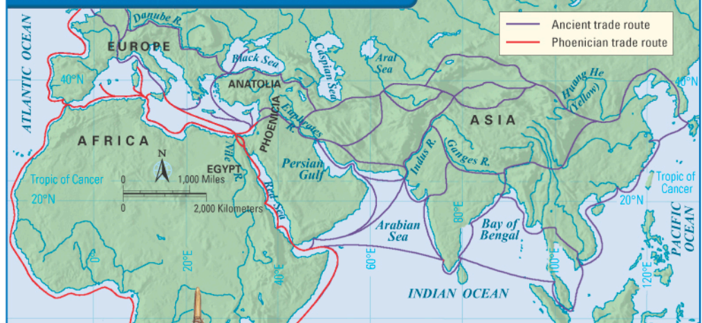
The Patterns of Ancient Trade, 2000–250 B.C.

Phoenicia was located in a great spot for trade because it lay along well-traveled routes between Egypt and Asia. However, the Phoenicians did more than just trade with merchants who happened to pass through their region. The Phoenicians became expert sailors and went looking for opportunities to make money.