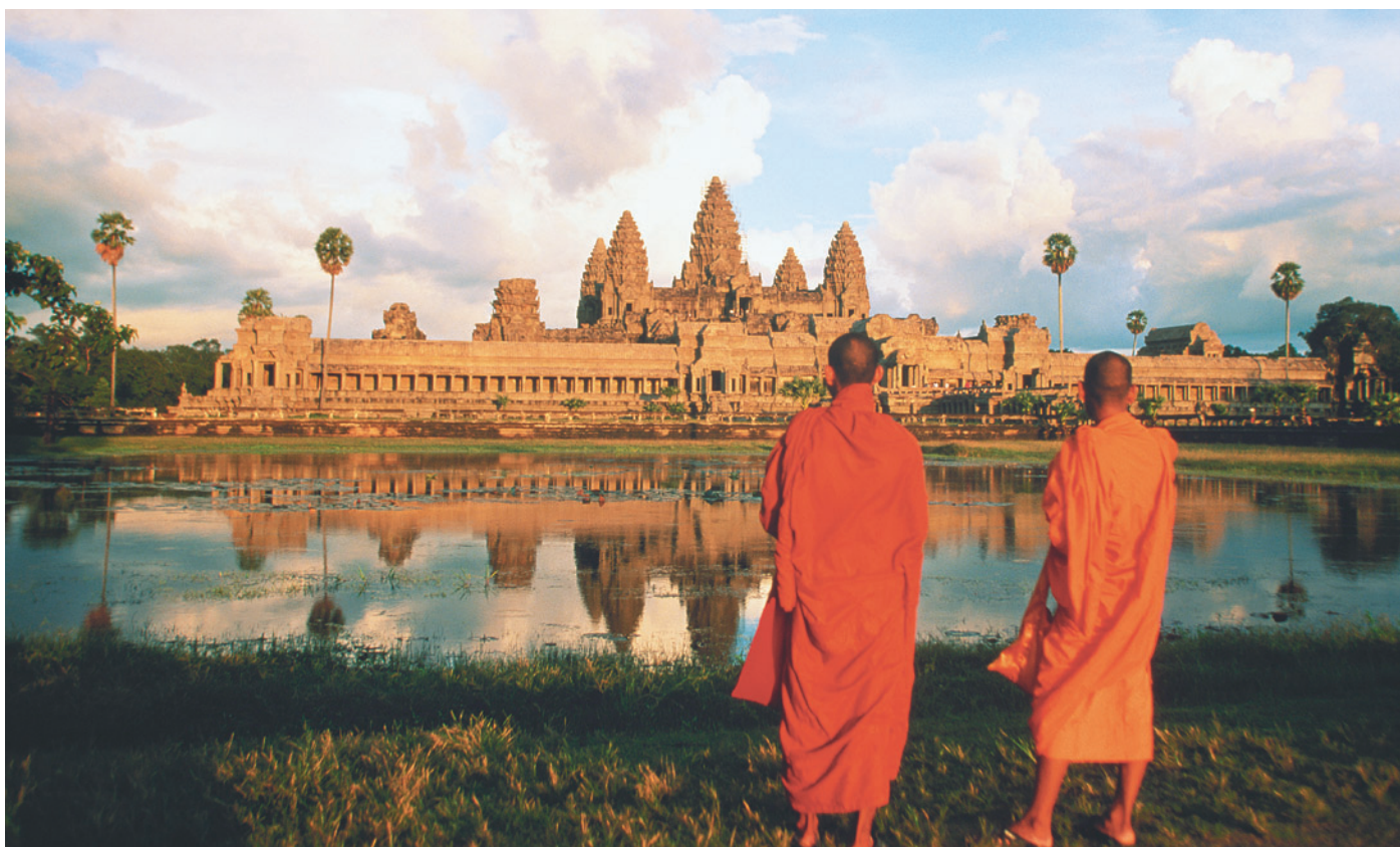
▲ Buddhist monks view a temple at Angkor Wat in Cambodia.

The Religious Community The five disciples who heard the Buddha’s first sermon were the first monks admitted to the sangha , or Buddhist religious order. At first, the sangha was a community of Buddhist monks and nuns. However, sangha eventually referred to the entire religious community. It included Buddhist laity (those who hadn’t devoted their entire life to religion). The religious community, together with the Buddha and the dharma (Buddhist doctrine or teachings), make up the “Three Jewels” of Buddhism.