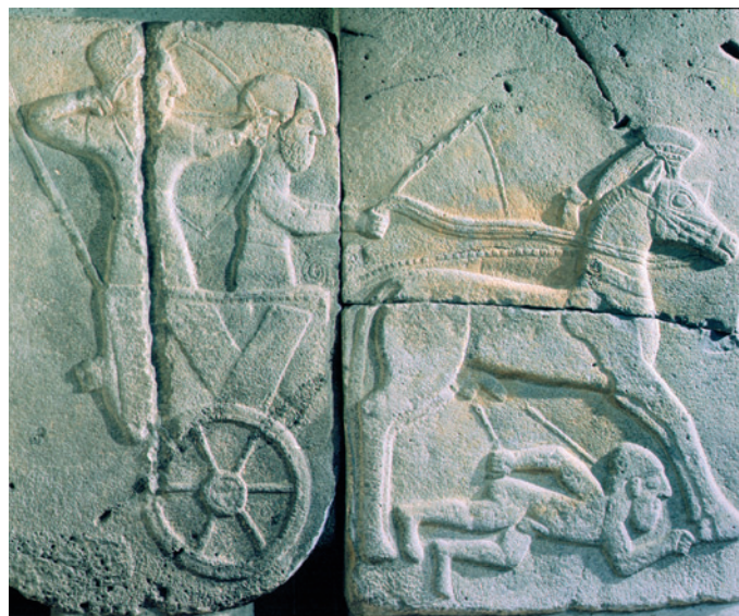
▲ This Hittite relief sculpture shows an archer in a chariot with his charioteer.

Despite its military might, the powerful Hittite empire fell quite suddenly around the year 1190 B.C. As part of a great wave of invasions, tribes attacked from the north and burned the Hittite capital city.